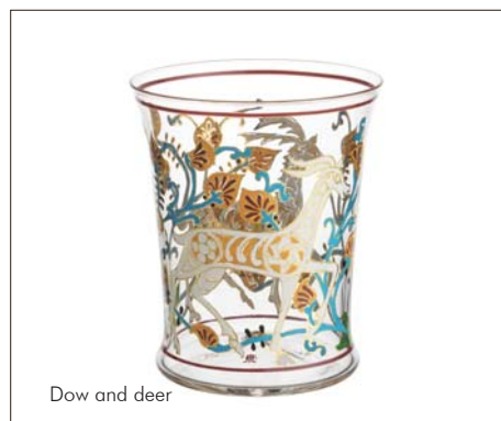
Doe and deer