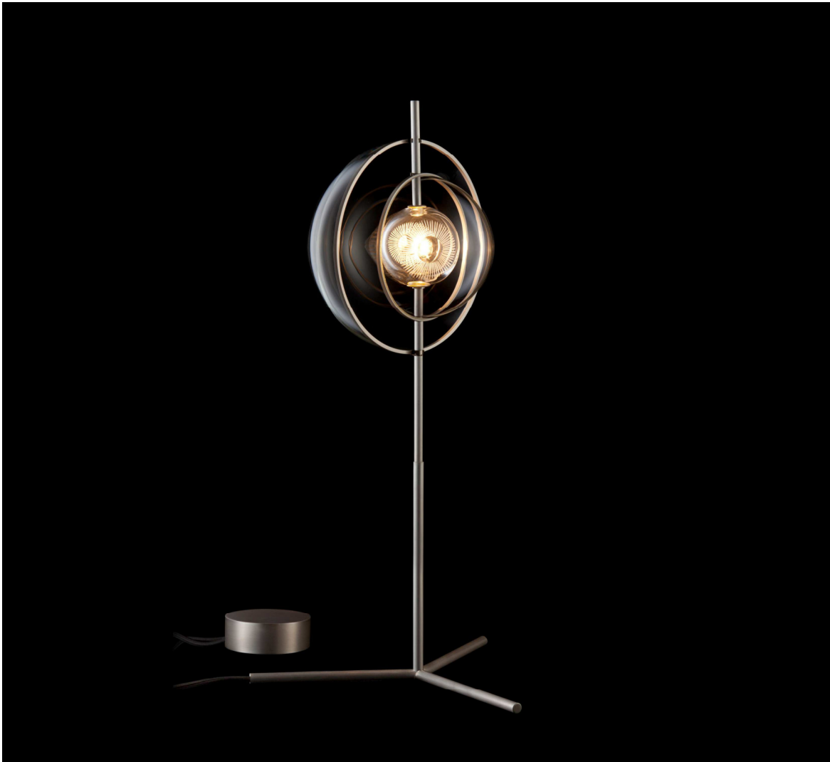
Table lamp 42453-A-1 - "Captured"