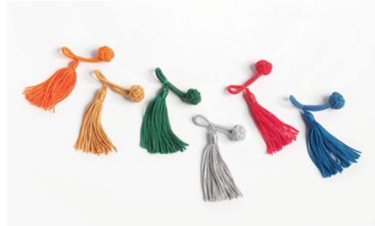
Winter: 73 orange, 55 gold yellow, 64 sea green 03 grey, 51 red, 94 azure