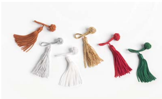
Christmas: 59 copper, 202 silver, 04 white 201 gold, 79 cherry, 22 green