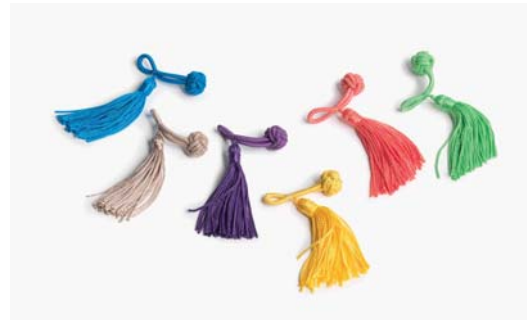
Summer: 72 turquoise, 34 beige, 98 lavender 54 yellow, 89 coral, 97 lime