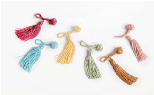
Spring: 76 fuchsia, 16 light blue, 91 cream, 105 linden green, 62 tangerine, 61 rose