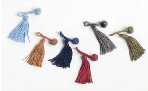
Fall: 160 horizon blue, 60 mid brown, 63 purple, 71 cerise, 02 dark grey, 70 khaki